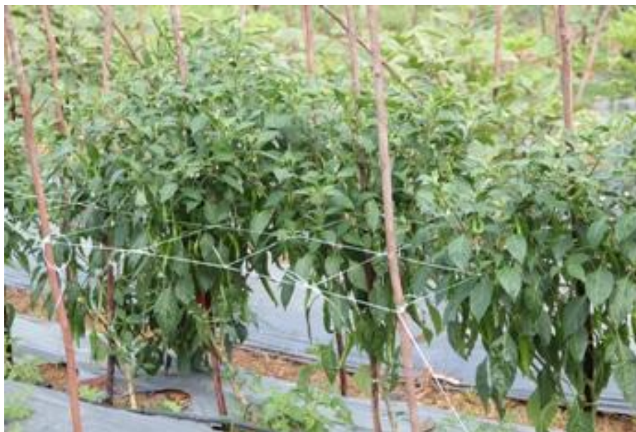
Staking of chilli plants

Staking is necessary to support the bearing branches of the chilli plants and to minimise lodging. This may be done one month after field planting.