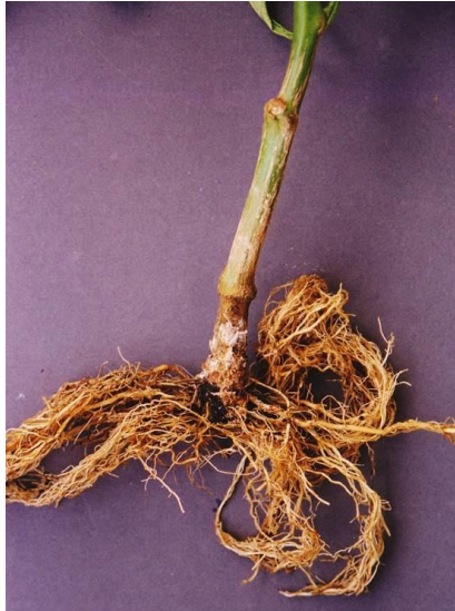
Sclerotium wilt of chilli caused by Sclerotium rolfsii