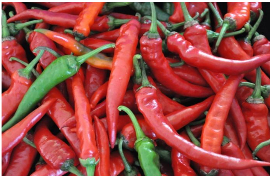
Fresh chilli Tarat

fresh market, the fruits are harvested mature but firm. Fruit harvesting is carried out every 3-4 days. The harvesting duration is about 3-6 months or more than a year if the plants are well maintained. Yield ranges from 10-24 mt/ha/season depending on variety, duration of harvest and level of management.