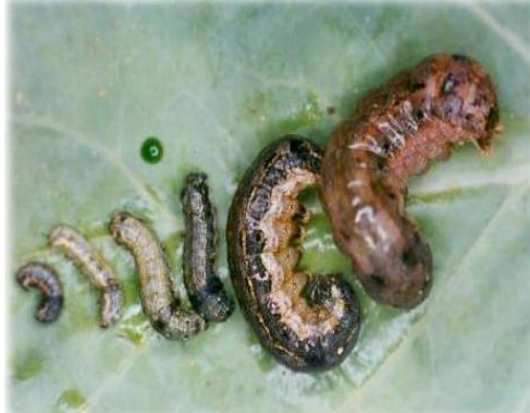
Stages of larva