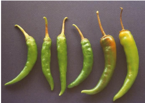
Fruit stalk wilt caused by the nematode Aphelenchoides besseyi