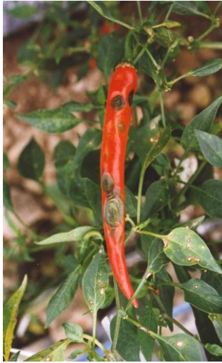
Anthracnose of chilli caused by Colletotrichum gloeosporioides and C. capsici