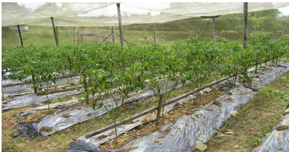
Chilli planting in nethouse