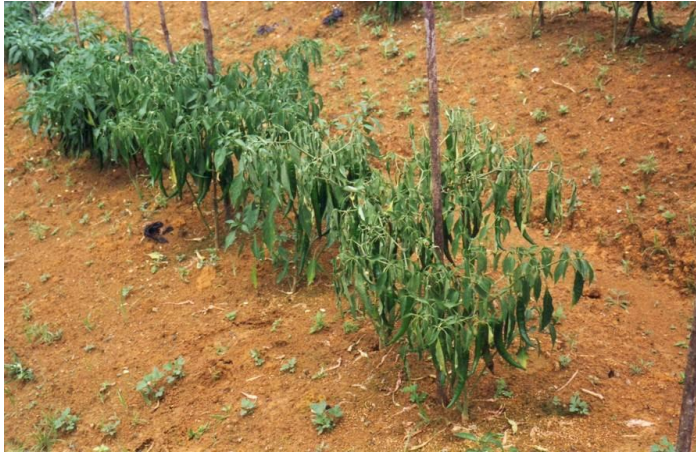
Bacterial wilt of chilli caused by Ralstonia solanacearum

There is no cure for the bacterial wilt-infected chilli. Remove the infected plant completely to prevent the disease from spreading to healthy plants. Removal of plants infected with the bacteria, Ralstonia solanacearum , from the vegetable bed will prevent the pathogen from building up in the soil and infecting neighbouring plants. Practice crop rotation with non-solanaceous vegetables.