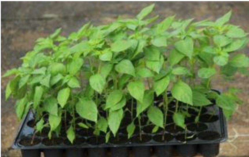
Chilli seedlings ready for transplanting

Chilli is planted from seeds. About 200-300g of seeds are required for one hectare of chilli cultivation. The seeds may be planted in well prepared nursery beds or seeding trays filled with Peat Gro or enriched soil. One or two sprays of foliar fertilisers and agrochemicals are necessary for healthy seedling growth. Seedlings are watered twice a day especially during the hot weather. Healthy seedlings are transplanted to the field when they are 4-5 weeks old.