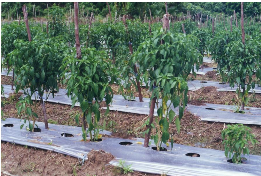
Chilli planting in open field and mulching with silvery plastic sheets